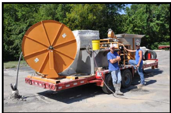
Crews pumping thermal grout into the wells.